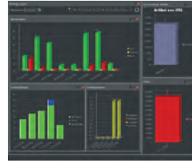
Dashboard: KPIs at a glance.