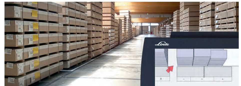
The forklift guiding system navigates the driver on the fastest way to the destination.